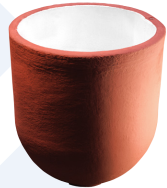
Fig.1: STAR coated crucible